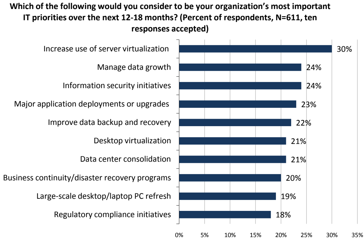
Figure 2. Top IT Initiatives for 2011